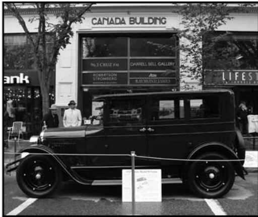
The restored Derby made its debut in front of the Canada Building in downtown Saskatoon on 24 August 2014. In the mid-1920s the Derby office was located in this building.

Left over funds from the Derby Car are being used to help finance the Model A restoration."